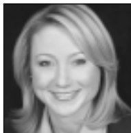
Ms. Belinda Stronach, MP Newmarket-Aurora